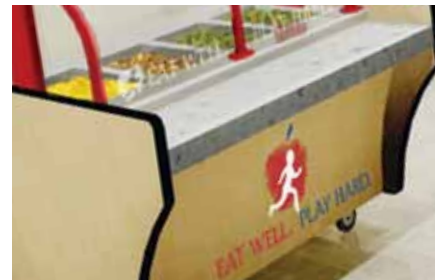
Highlight Program Initiatives