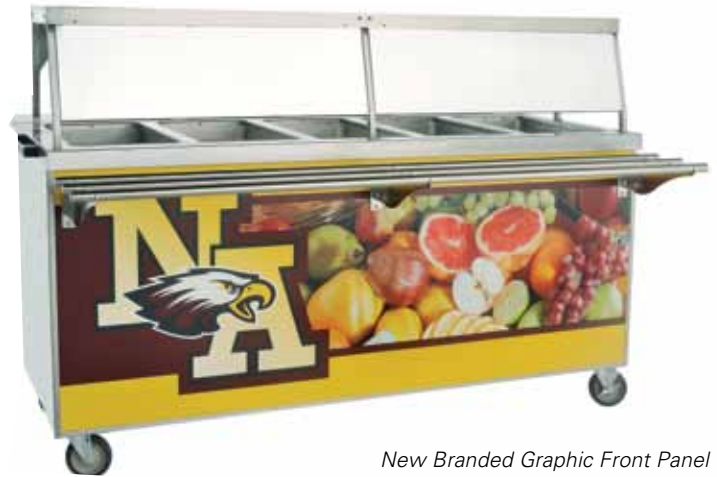
New Branded Graphic Front Panel