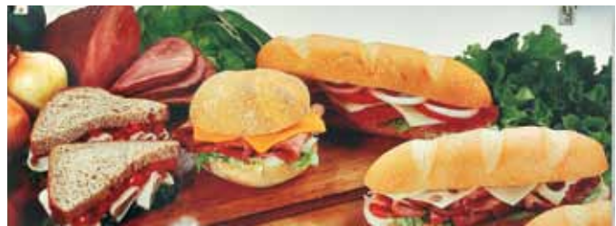
Serving Line Front Panels