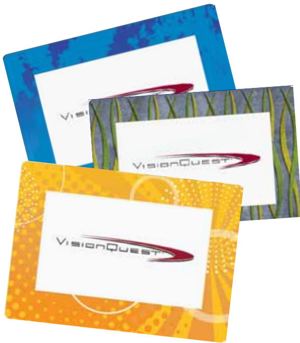
Digital Menu Frame Options