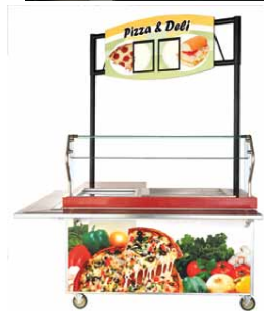
Station Signage with Flex Panels