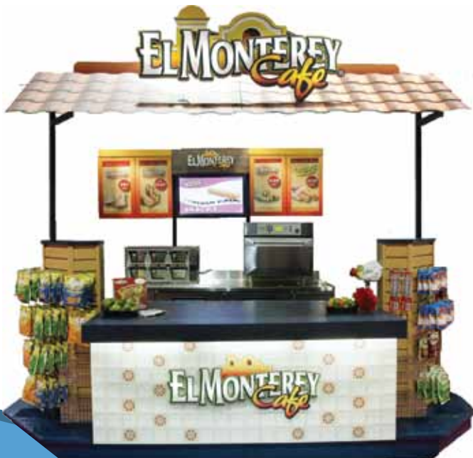
Food Court Atmosphere