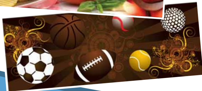
New Front Panel Graphics